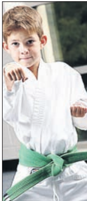
Ancient Ways Martial Arts (941) 756-0800 www.awmaa.com

Best of all, the positive changes in your child. Don't miss this opportunity. Call today for more information.